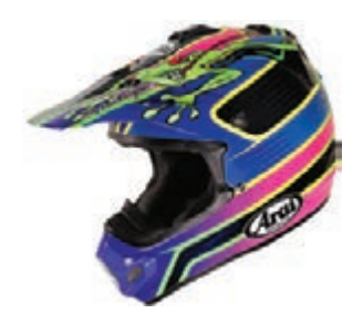
Barcia-3 <u>10-790x</u> (H)

VX-PRO4 P/N Key: XXS-2, XS-3, S-4, M-5, L-6, XL-7, XXL-8 (e.g. 09-245x)