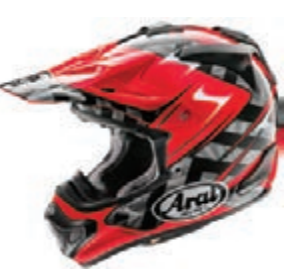
Scoop Red <u>10-795x</u> (H)